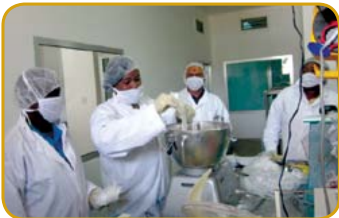
KSP students manufacturing Tylenol in August 2011