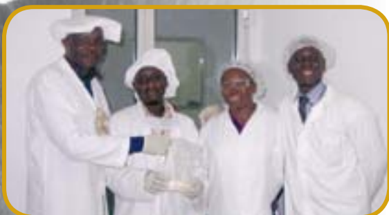
KSP Students with tablets they manufactured