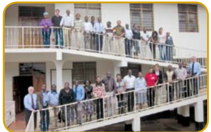
KSP students in August 2011