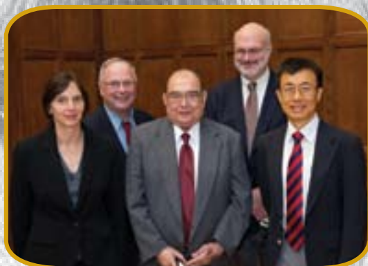
Amorphous Solids session speakers with Garnet Peck

Over 100 participants attended the 9th Annual Garnet E. Peck Symposium at Purdue on October 20. This year's Symposium focused on pharmaceutical solids, with sessions on amorphous and crystalline solids. The presentations covered cutting-edge discoveries for both types of solids, including transformations between crystal forms (polymorphs), the development of novel cocrystals, and the design of amorphous forms with enhanced solubility. Bio-sketches and abstracts of the speakers are available at www.ipph.purdue.edu/peck/ and photos of the event are at www.pharmacy.purdue.edu/features/2011-10-20.PeckSymposium/ .